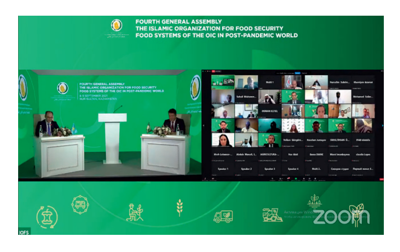
Due to global pandemic, Fourth General Assembly of IOFS was held virtually.

All projects and activities are united by a common goal – to improve food security with special focus on Sustainable Development Goals (SDGs) and IOFS Strategic Vision 2031 .