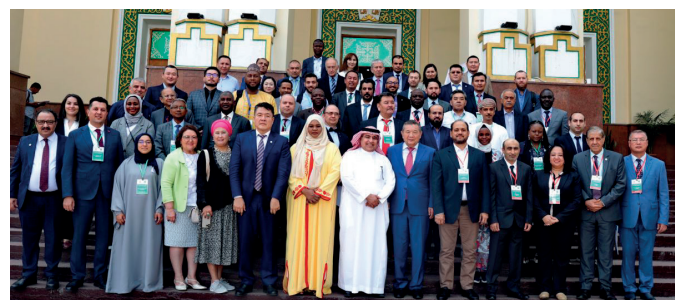
IOFS High-Level Forum on Food Security.

In August-September 2021 IOFS has organized a Water Hub Workshop with online participation of 10 African Member Countries. Subsequently, the IOFS is launching a Water Integrated Plan for